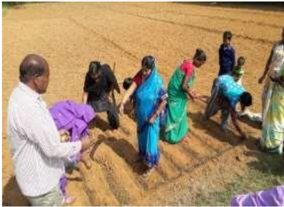
← Demonstration of Spice Cultivation through Scientific Method