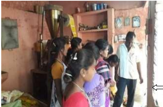
← Exposure Visit of women SHG members at Annapurna Industries to understand process for Spice Processing, Grinding and Packaging