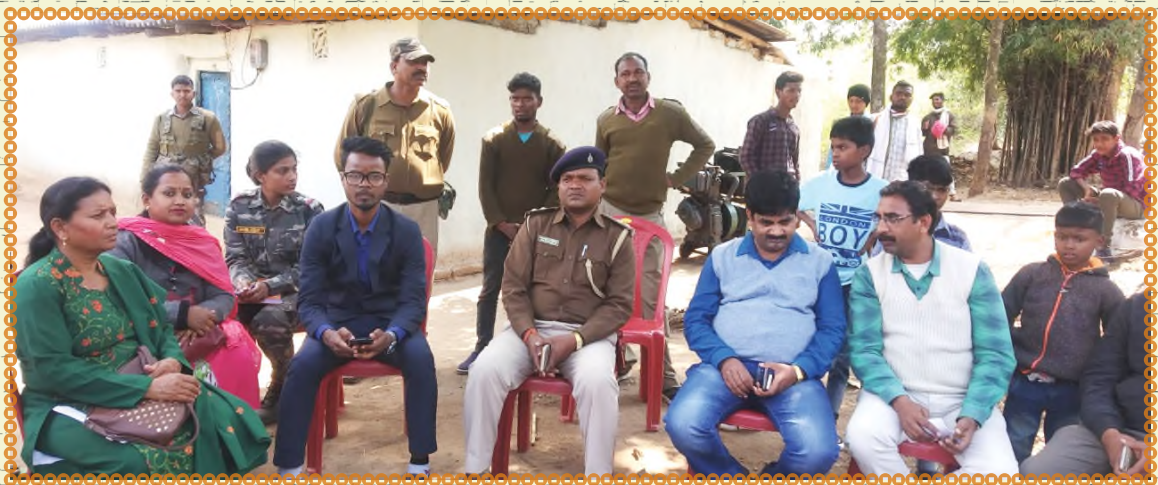
CHILD MARRIAGE raid