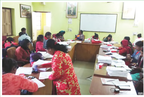
Animator training Under E-shakti 2