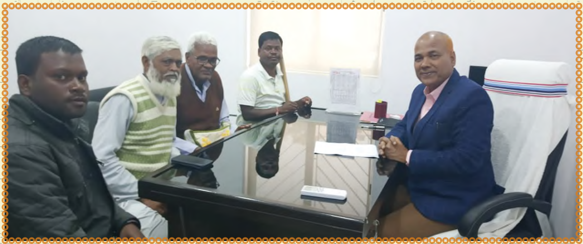
DPO members meeting with disability Commissioner