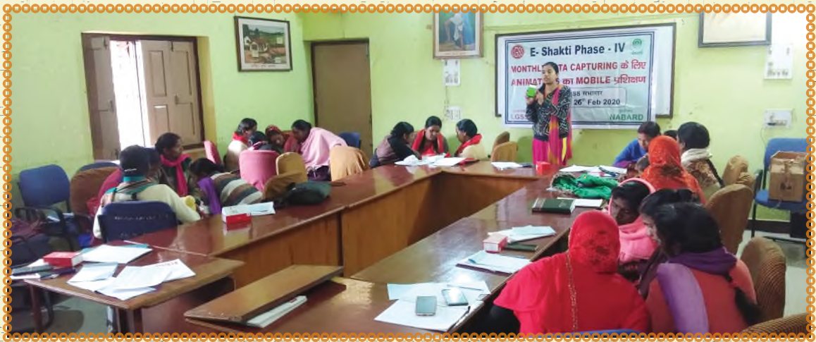
Animator training under E-shakti