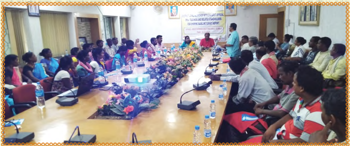
District level Base line survey sharing meeting with Govt. department