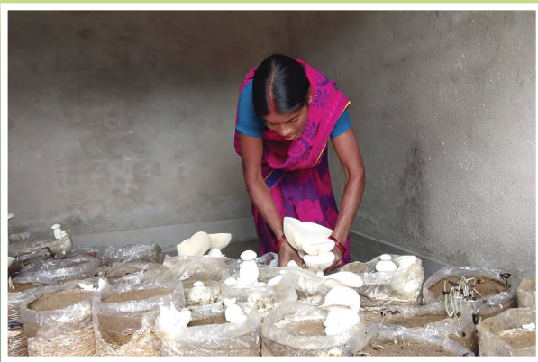
Mushroom demonstration unit