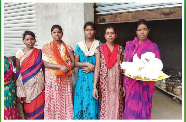
Mushroom Cultivation by WSHG Member