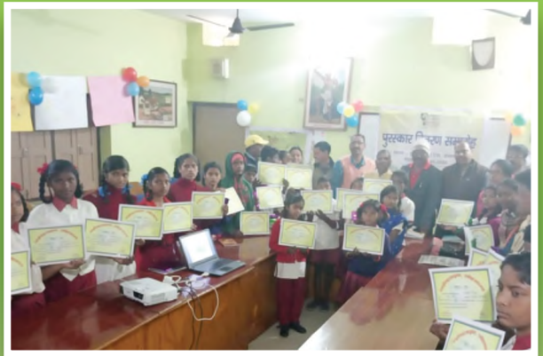
Prize distribution ceremony to children