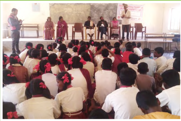
Story telling Workshop for children