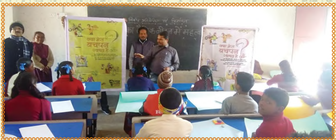
Awareness program for children