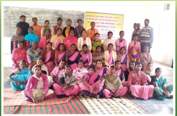
Training for AWC Worker on teaching methodology