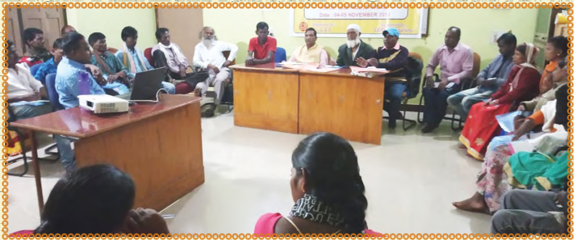
Reflection meeting of DPO